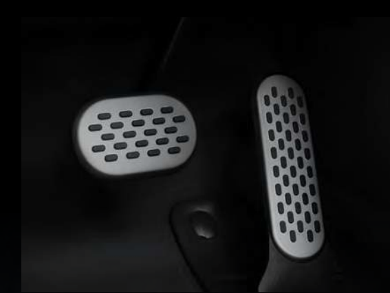
Aluminum Sport Pedals