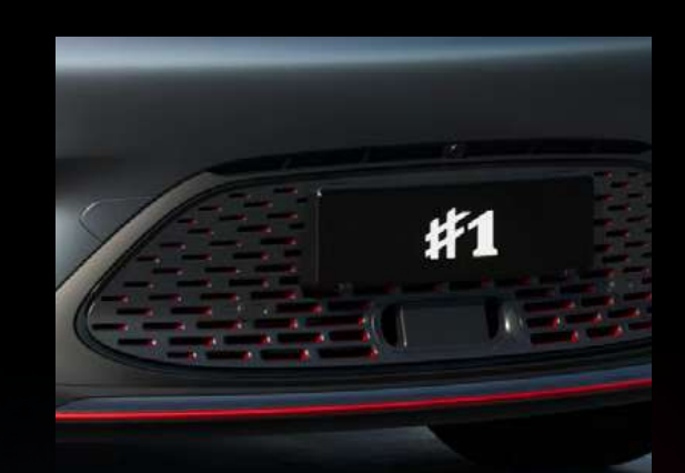
Black honeycomb mesh grill