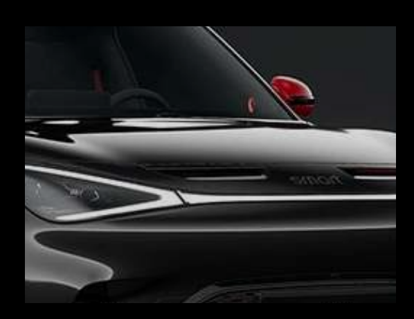
Sporty front hood with glossy black logo