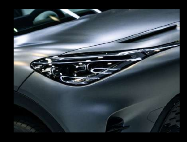
CyberSparks LED+ Matrix headlights