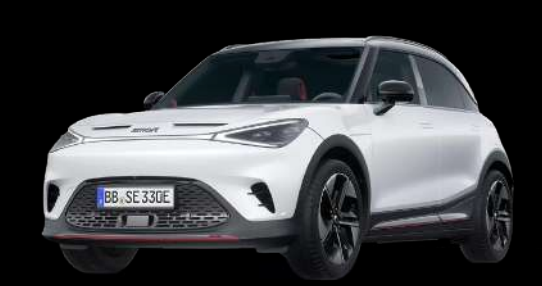
Eclipse Black Roof