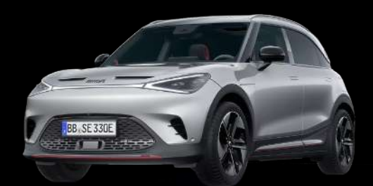
Cyber Silver Metallic