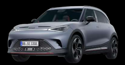
Atom Grey Matte