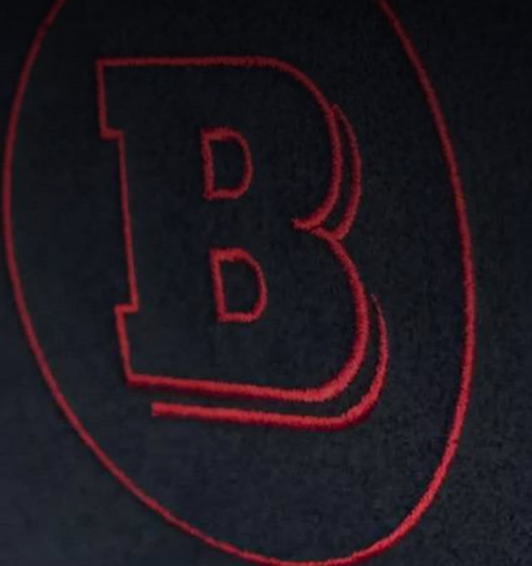
BRABUS Alcantara-wrap steering wheel