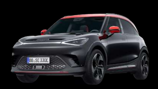
Radient Red Roof