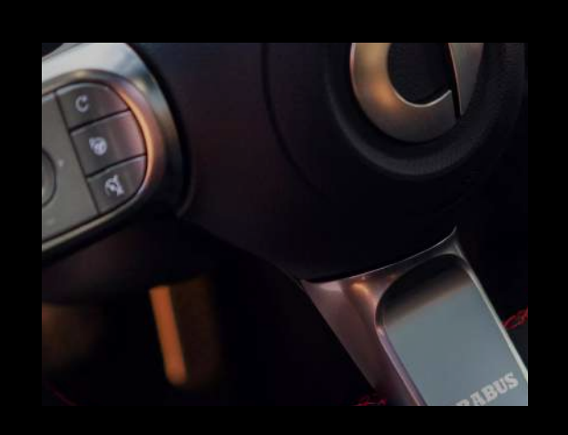
Steering wheel driver controls