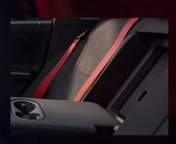
Microfiber Suede Seats