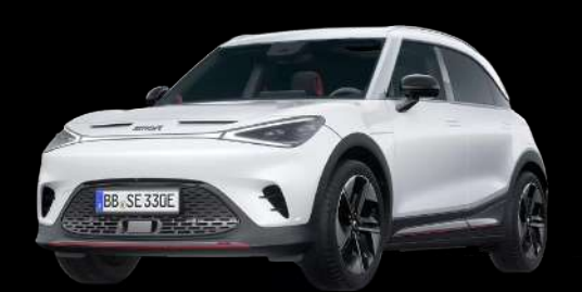
Digital White Metallic