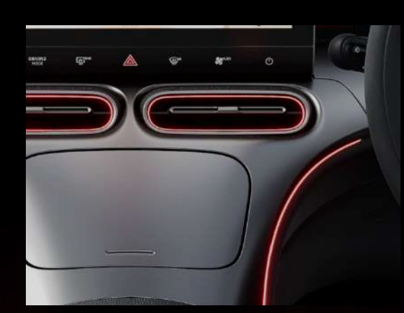
Unique styled air vents