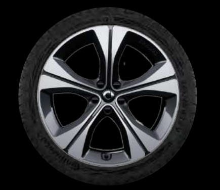
20" Synchro-245/40 R20