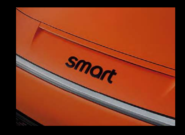
Sporty front hood with glossy black logo