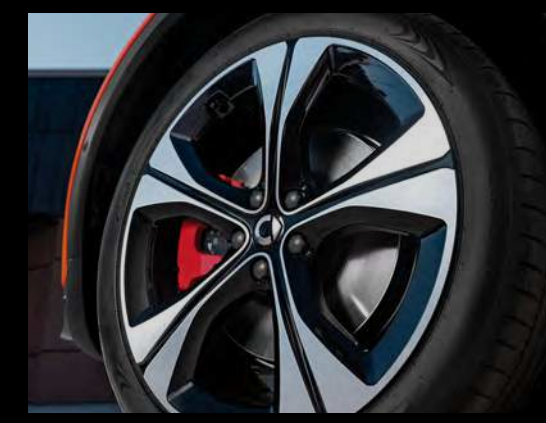
20" Synchro wheels and red brake calipers